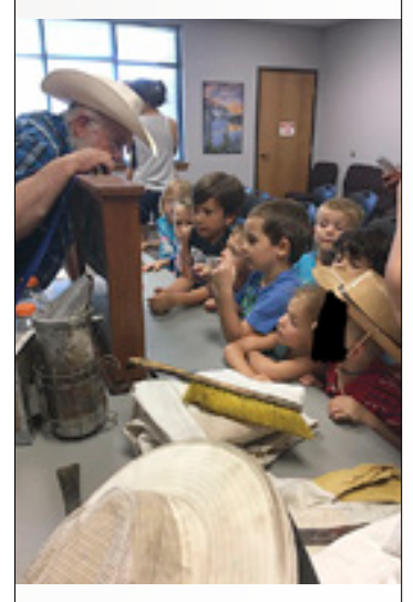
Making crafts at the trading post was a favorite VBS activity.

inety-one children, ages 3–12, traveled to Cactusville, a small mining town in the Wild West, during the Spokane Valley Church's Vacation Bible School, held July 17–21. Throughout the week, they discovered they