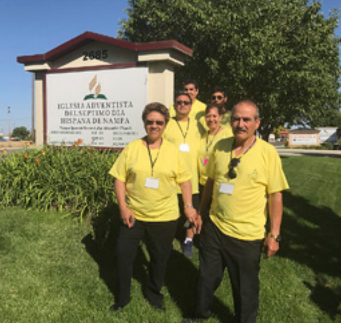
Listos para servir.

su iglesia a otro nivel con las siguientes tres bendiciones derivadas de la FERIA DE SALUD: Primero: Renovamos nuestra UNIDAD . Segundo: Aumentamos nuestra COOPERACIÓN . Y tercero: Fortalecimos nuestra capacidad de ORGANIZACIÓN .