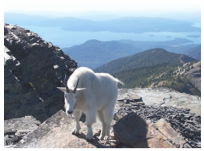
The view from Scotchman's Peak.

After a few hours of getting acquainted, the group enjoyed a haystack dinner, followed by singing and